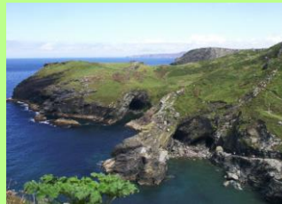
Caves in Tintagel, Cornwall