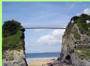
Towan Beach, Cornwall