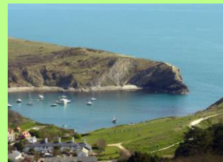
Lulworth Cove, Dorset