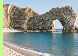
Durdel Door, Dorset