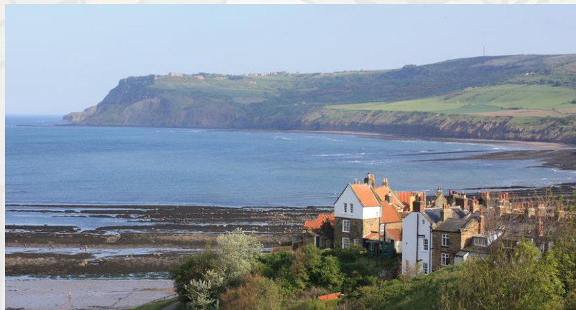
Robin Hood's Bay, 2015