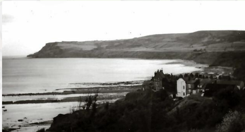
Robin Hood's Bay, 1958

Look at the two images. How has the location changed?