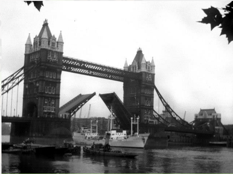
Tower Bridge 1956