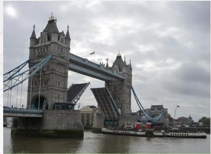
Tower Bridge 2015

Why do you think this view hasn't changed?